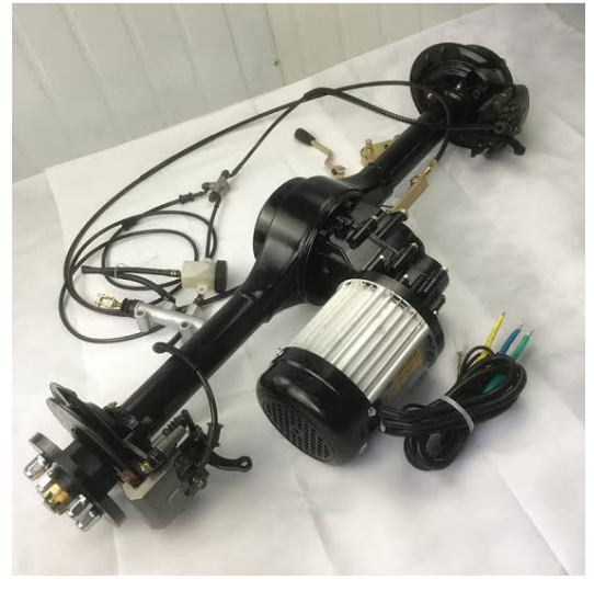
Fig. 3 MotorwithAxle

The motor is electronic machine which converts electrical energy into mechanical energy by batteries in E-vehicles. In E-vehicles motors are the engine to drives the vehicles. First electric motor was invented by Thomas Davenport of Vermont in the year 1834, Joseph Henry and Michael Faraday have created early motion devices by using the electromagnetic fields. The early motors created by using spinning disks or levers that rocked back and forth. The efficiency of IC engine is 50 to 65% where as in electric motor efficiency is 90% even may up to 97%. A DC motor is usually supplied through a slip ring commutate. AC motors commutation can be achieved by using either a slip ring commutation or external commutation, can be fixed-speed and/or variable-speed control type, and synchronous asynchronous can be type. Universal motors can run by either AC or DC. E-vehicles can be finely controlled and provide high torque from resting position, unlike internal combustion engines they do not need multiple gears to match power requirements. In E-vehicles the use gearboxes and torque converters can eliminated.