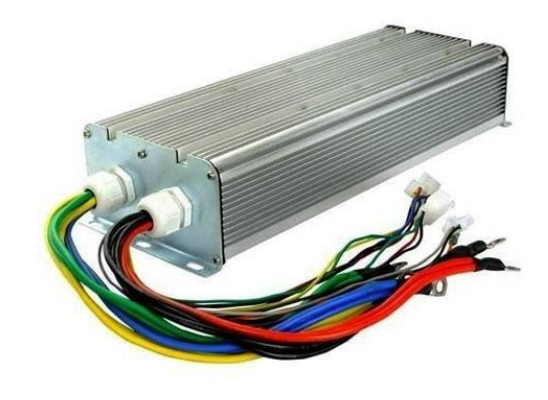
Fig. 5 Controller

The modern companies are manufacturing the motors along with their compactable controller. The controller is used to control, monitoring, feed backing the entire vehicle. The use of controller is must in the modern E-vehicles since all the vehicles are manufactured to run at high speeds. The advantages using controller along with motor.