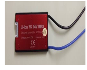
Fig. 2 BMS

Fig. 2 shows an Batter management system.