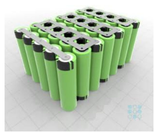
Fig.1 Li-ion Battery Pack